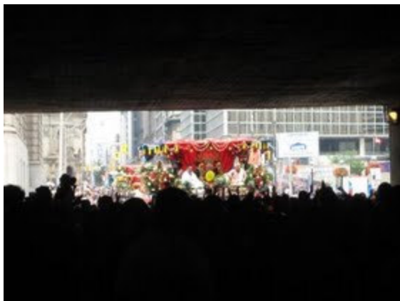
Lord Balarama entering the Tunnel

people took pictures, wondered what everyone was doing, and they clapped also receiving Lord Jagannath's mercy. My favorite part out of the